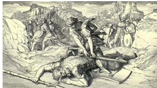
Scenes from "David and Goliath" spot. "Who will stand up for you?"